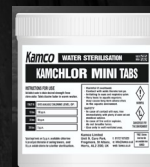
Kamchlor chlorine donor tablets