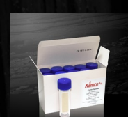
Combi dip slides