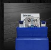
Chlorine level test kit