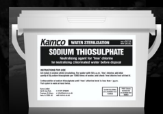
Sodium thiosulphate neutralising agent